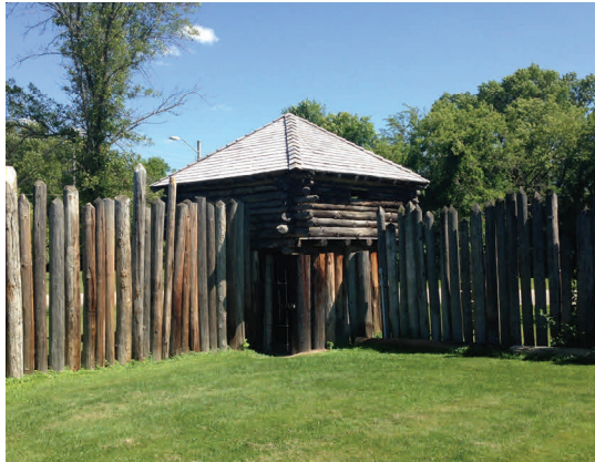
Roofing of Fort Cosconong Guard Towers

The Community Foundation is a 501(c)3 organization. Your contribution is fully tax deductible.