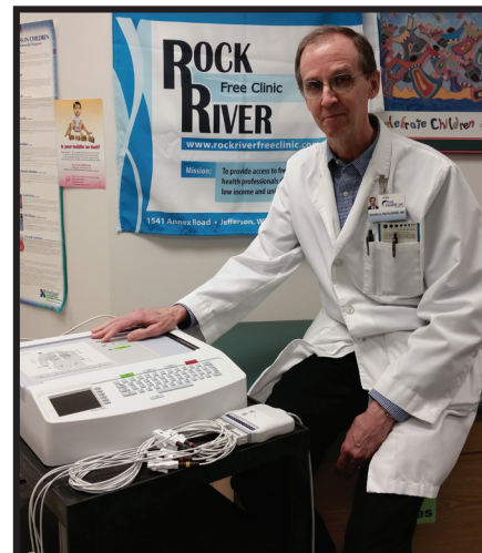
EKG machine for Rock River Clinic