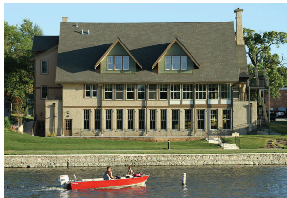
Restoration and renovation of the Fort Atkinson Club

poured in during our last fiscal year. Other brick and mortar projects receiving Foundation grants included the Humane Society's new shelter and the remodeling of the National Dairy Shrine's Visitors Center. Projects benefiting the youth in our community included scoreboards at Memorial Park & JF Luther, playground equipment for Trailways Park, and the new Barrie School site for the Boys & Girls Club.