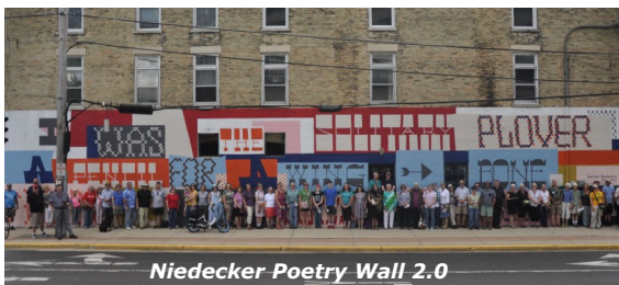
Niedecker Poetry Wall 2.0