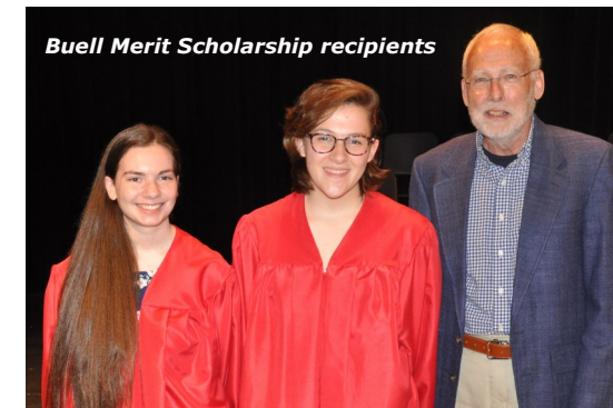
Buell Merit Scholarship recipients

community members and organizations who champion those projects. It is impossible for five board members to understand all the needs of our community and we depend heavily on project champions who get behind an improvement and then take it through to the finish line. This is how hundreds of our projects have come to be over the years. We are thankful for the help.