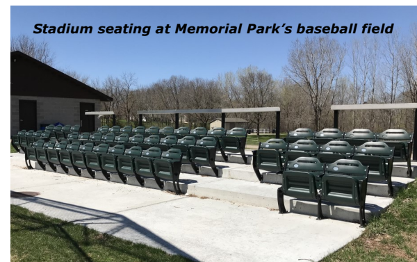
Stadium seating at Memorial Park's baseball field

We also want to emphasize that our Board acts as a steward of the funds that have been donated over the years and decides how and where to support projects. But this does not even begin to happen unless we have