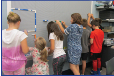
Innovation Lab at Luther School

We also want to emphasize that our Board acts as a steward of the funds that have been donated over the years and decides how and where to support projects. But this does not even begin to happen unless we have community members and organizations who champion those projects. It is impossible for five board members to understand all the needs of our community and we depend heavily on project champions who get behind an improvement and then take it through to the finish line. This is how hundreds of our projects have come to be over the years. We are thankful for the help.