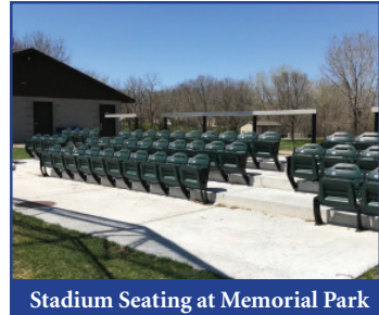
Stadium Seating at Memorial Park

"To say I am appreciative is an understatement! When I took a gap in my schooling, I always hoped I would look back in time from some far-off place and marvel at how far I'd come. You have helped me keep moving in the right direction and to look at my future with a smile!"