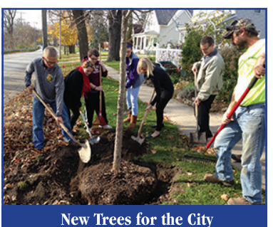
New Trees for the City