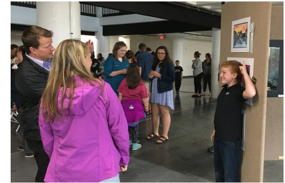
Ernie Pope Memorial Art Awards

Thanks to the generosity of the community it serves, since the Foundation began in 1973, it has poured over $19.5 million in grants back into the community, making Fort Atkinson a special place to live, work and play.