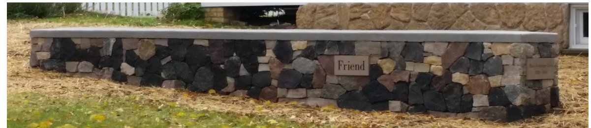
Gates Memorial Wall at Hoard Museum