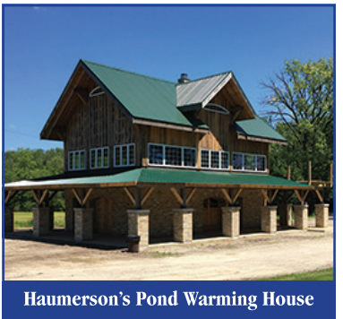
Haumerson's Pond Warming House

"I feel very blessed to have grown up in Fort Atkinson where the community is so supportive of education and invests in our future."