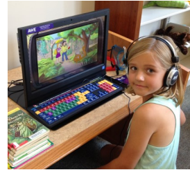
Early literacy computers for public library

Thanks to the generosity of so many who care about Fort Atkinson, we were able to grant almost $250,000 in support of projects improving the fabric of our community. Perhaps nothing illustrates the range of the Foundation's impact better than two of the grants we made this year—one for early literacy computers at the public library to help our youngest of learners, and one to help install a hearing loop system in the Senior Center to help our eldest citizens reap the full benefit of activities there.