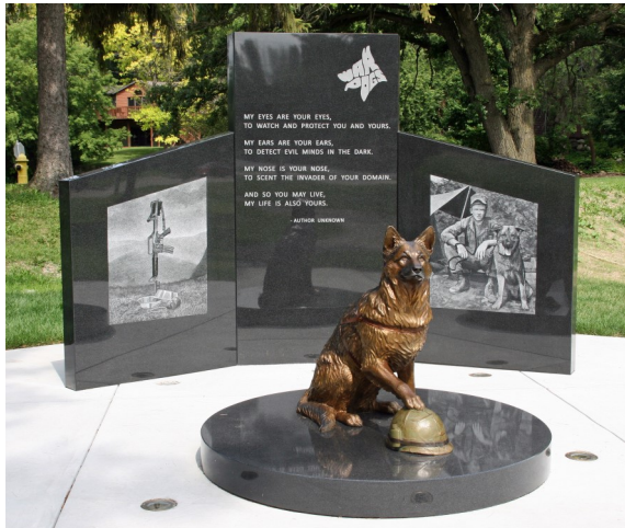
K9 Veterans Memorial in McCoy Park

The Community Foundation is a 501(c)3 organization. Your contribution is fully tax deductible.