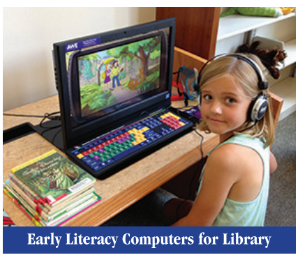
Early Literacy Computers for Library

Thanks to the generosity of so many who care about Fort Atkinson, we were able to grant almost $250,000 in support of projects improving the fabric of our community. Perhaps nothing illustrates the range of the Foundation's impact better than two of the grants we made this year—one for early literacy computers at the public library to help our youngest of learners, and one to help install a hearing loop system in the Senior Center to help our eldest citizens reap the full benefit of activities there.