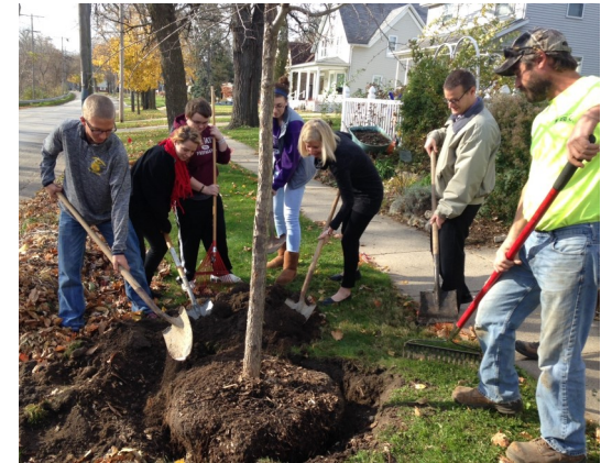
Hundreds of new trees to replace those damaged by the emerald ash borer

We were able to make these investments in the community and in our young people thanks to the many forward-thinking people who continue to invest in the