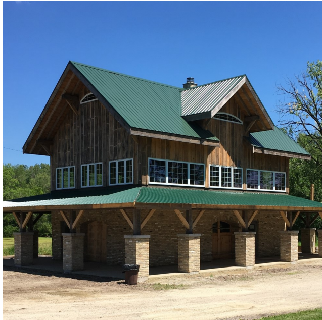
Warming House at Haumerson's Pond

Credit card donations can be made on our secure website, www.fortfoundation.org .