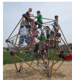
PlayWeb for Luther School

This past year, the Foundation invested in our community by distributing 26 grants totaling $422,487. It was a year focused on 'play' for the Foundation as we helped fund playground equipment at Barrie and Luther Elementary schools as well as in Jones Park; a music trailer to transport equipment for our school district's performing arts department; and lighting and technical upgrades in the high school auditorium.