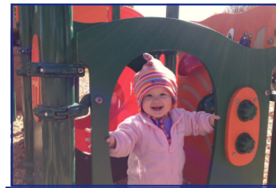
Embraced Playground at Jones Park