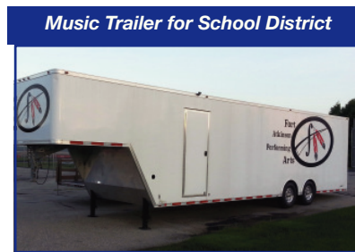
Music Trailer for School District