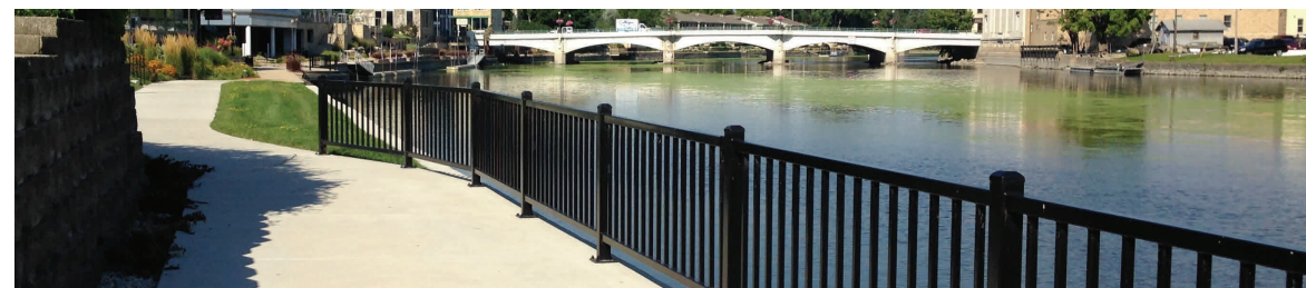
Extension of the downtown Riverwalk