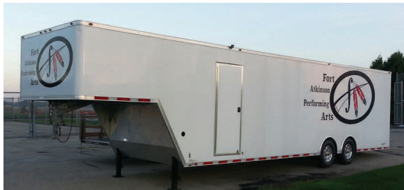
New music trailer for school district's performing arts program

The Community Foundation is a 501(c)3 organization. Your contribution is fully tax deductible.