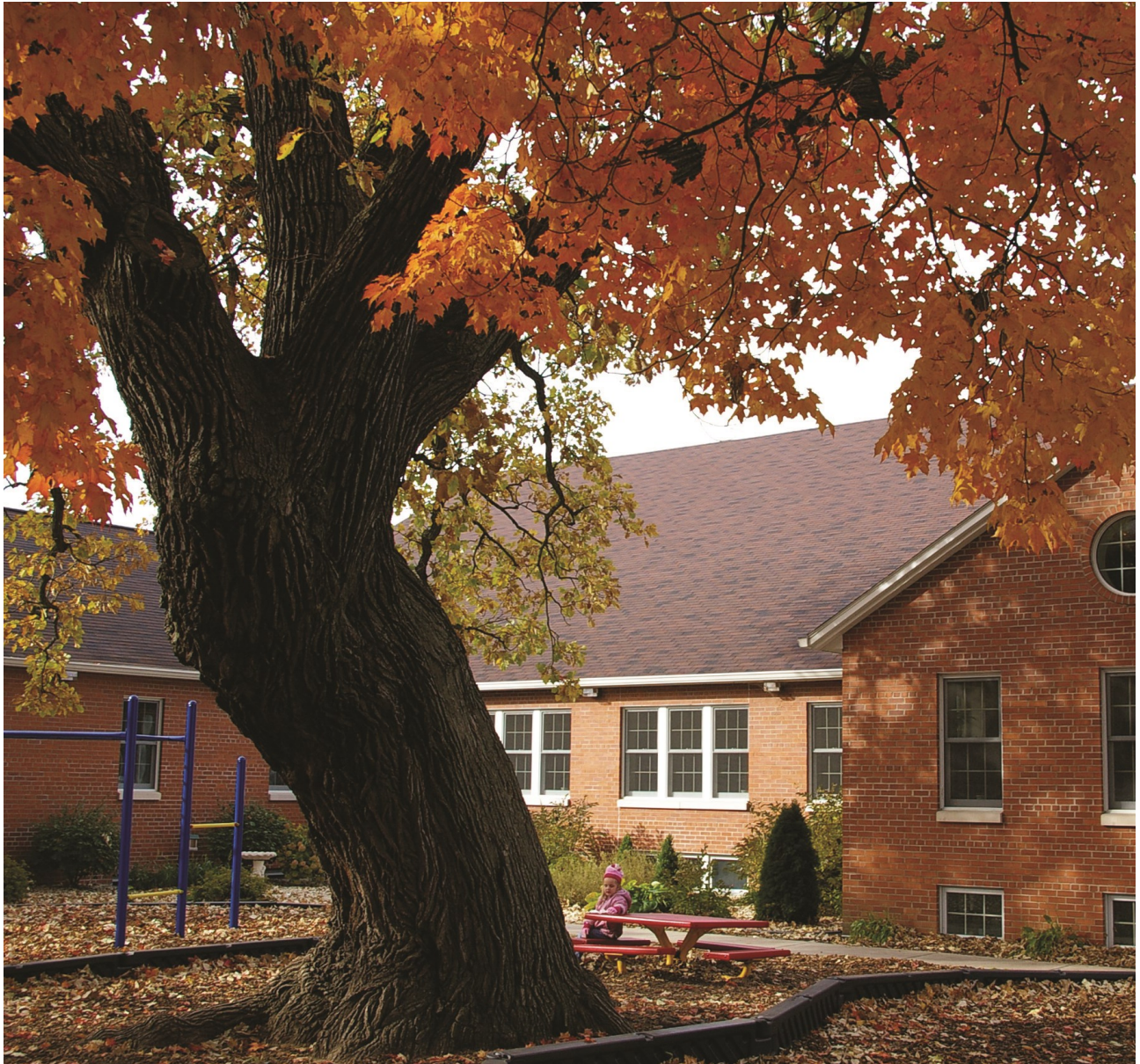
The magnificent Bur Oak, estimated to be at least 300 years old, at the First Congregational Church.

About Us: The Fort Atkinson Community Foundation helps you support the charities and the causes you care about. You can donate to its existing funds or you can create your own, either now or through your estate. FACF invests the money, and the earnings support grants to nonprofits. You gift will benefit our community FOREVER.