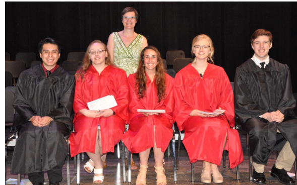
2018 Batterman Family Scholarship recipients

$275,656 paid in scholarships to 102 local students and $309,450 awarded in scholarships to 85 local students