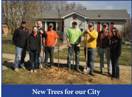
New Trees for our City

Looking back at all the projects the Foundation supported this past year, I am reminded of the power of 'we.' Working together, we made a big difference for our community – by helping provide an ambulance, new trees, and a police dog for our city; by supporting our kids through grants to the Boys and Girls Club, the Books on Bikes summer program, and to Fort HealthCare to fund behavioral health counseling sessions for some of our high school students; by facilitating unique projects such as the Haumerson's Pond Warming House and the K9 Veterans Memorial; and by giving local students a chance to follow their dreams with our remarkable scholarship program.