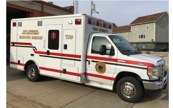
Ambulance for the FA Fire Dept.

To all those who have contributed to the Fort Atkinson Community Foundation this past year, please accept my sincere thanks for being part of this powerful 'we.'