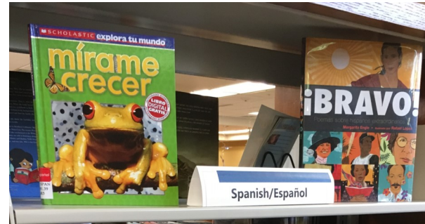
Spanish language collection for the public library

chance to follow their dreams with our remarkable scholarship program.