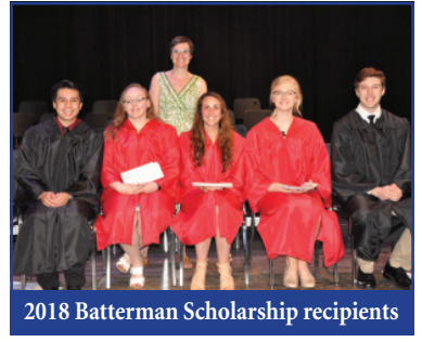
2018 Batterman Scholarship recipients