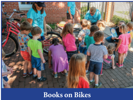
Books on Bikes

Looking back at all the projects the Foundation supported this past year, I am reminded of the power of 'we.' Working together, we made a big difference for our community – by helping provide an ambulance, new trees, and a police dog for our city; by supporting our kids through grants to the Boys and Girls Club, the Books on Bikes summer program, and to Fort HealthCare to fund behavioral health counseling sessions for some of our high school students; by facilitating unique projects such as the Haumerson's Pond Warming House and the K9 Veterans Memorial; and by giving local students a chance to follow their dreams with our remarkable scholarship program.