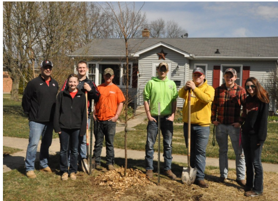
Fort Tree Fund supporting a multi-year plan to plant hundreds of new trees for the City