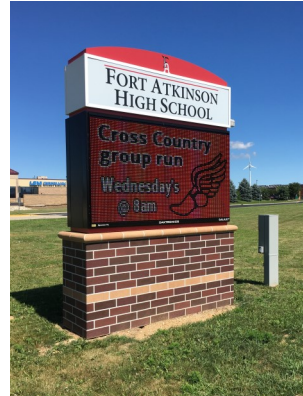
New sign for the high school

Looking back at all the projects the Foundation supported this past year, I am reminded of the power of 'we.' Working together, we made a big difference for our community – by helping provide an ambulance, new trees, and a police dog for our