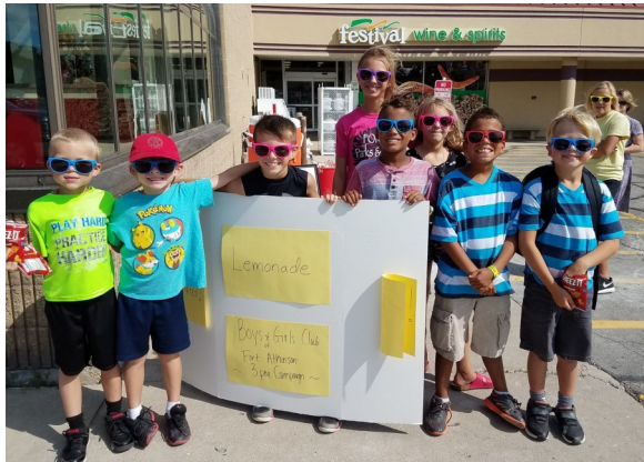
Fort Atkinson Boys & Girls Club Fund supporting our afterschool program