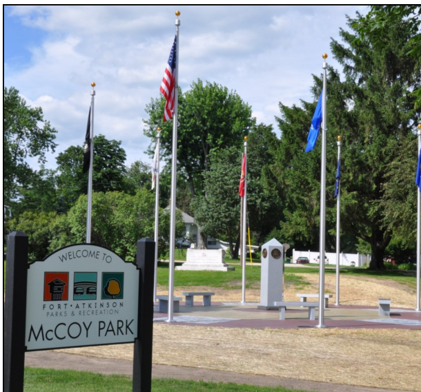
Veterans Memorial in McCoy Park