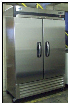
Cooler for the Fort Atkinson Food Pantry

It was a busy year at the Foundation as we received 790 separate donations totaling $1,477,468. Most of these gifts were made to our pass-through funds with the goal of helping local non-profit groups such as Rock River Heritage, Friends of Haumerson's Pond, Project Lead, and Friends of McCoy Park bring their creative and exciting community projects to life.