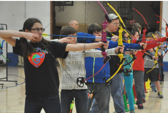
Equipment for the Middle School Archery Club

The Community Foundation is a 501(c)3 organization. Your contribution is fully tax deductible.