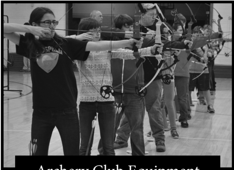
Archery Club Equipment