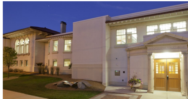
$1.5 million for the Dwight Foster Public Library

In addition to receiving gifts, we also made payments on grants and scholarships totaling $1,094,913. These distributions were made in support of our mission to enhance the quality of life for Fort Atkinson residents. Of particular note among the many distributions was the final