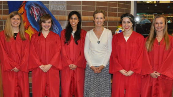
2014 Batterman Family Scholarship recipients

Scholarship Fund — Support educational opportunities for area students.